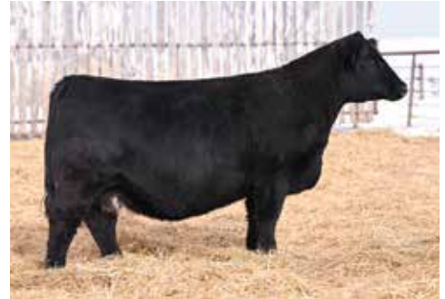
OMF FRINA F25 | Maternal Granddam of Lot 31