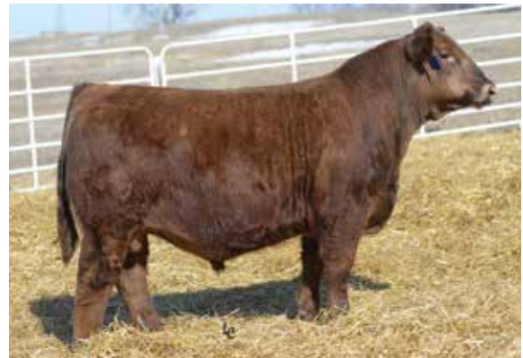
KBHR SNIPER E036 | Sire of Lot 89

Due to calve 1/9/24 to GW COPPERHEAD 919G (ASA: 3549340). PE 6/1/23-10/31/23 to ES HF145 (ASA: 3758212). Likely Safe AI.