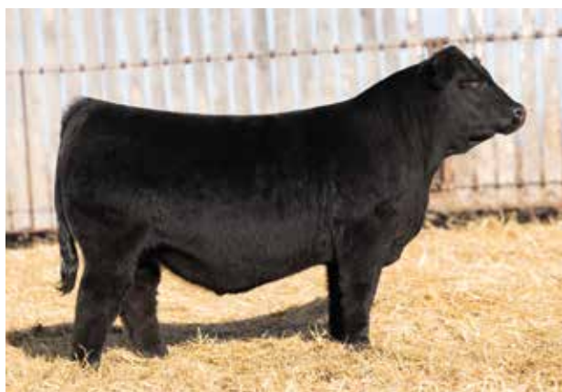
OMF REST ASSURED J18 | Maternal Brother to Lot 10