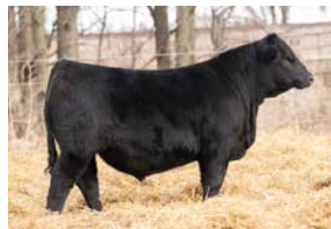
FIVE STAR JAWS J28 Maternal Brother to Lot 5