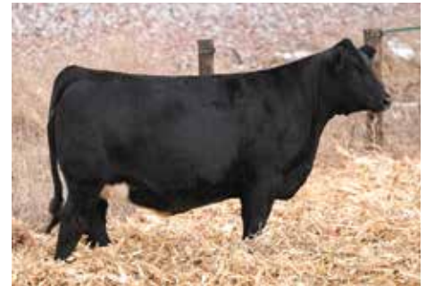
OMF/DK CHEERS C88 Dam of Lot 59