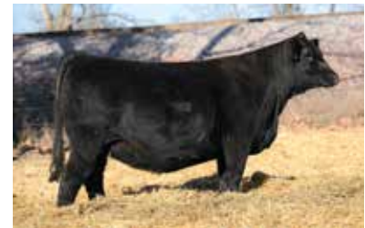
FIVE STAR KIMBER K7 Maternal Sister to Lot 26 – She sells as Lot 82!