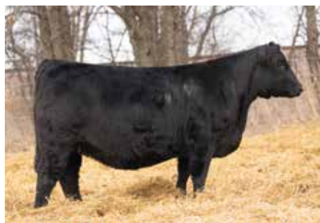
FIVE STAR HAPPY H23 $25,000 Maternal Sister to Lot 5