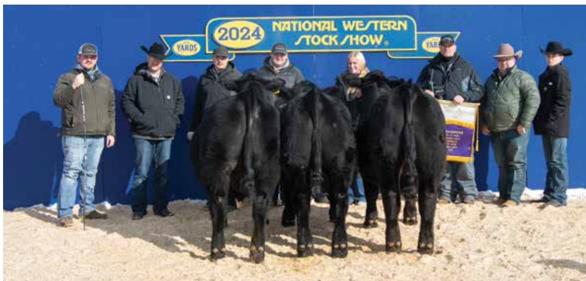
LOT 33 - OMF LAREDO L8 | LOT 10 - OMF LEVERAGE L22 | LOT 2 - OMF LAST MINUTE L16 Members of the 2024 National Western Stock Show Grand Champion Pen of Three Simmental Bulls