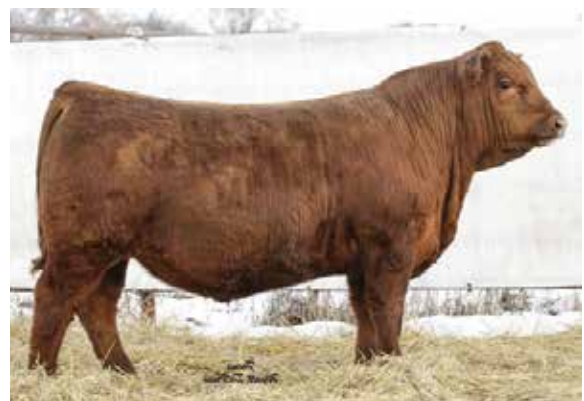
GW COPPERHEAD 919G | Service Sire to Lot 89