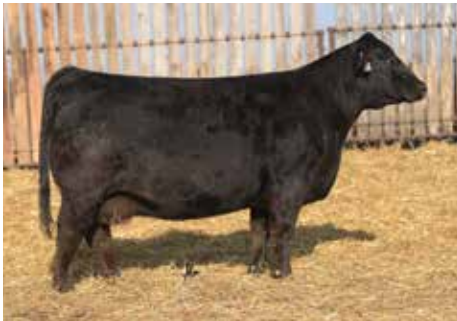
OMF TIME LESS B100 Dam of Lot 51