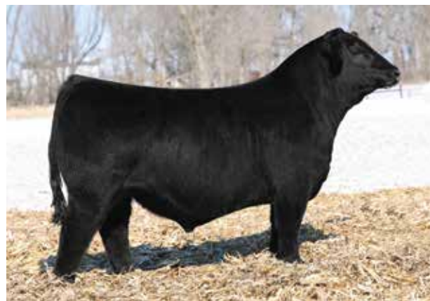
OMF JOURNEYMAN J24 | $110,000 Maternal Brother to Lot 2