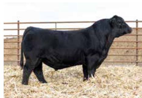
OMF TIME LESS B100 | Prolific Dam of Lot 1