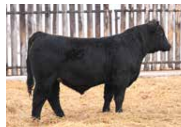
OMF KENSINGTON K19 | Maternal Brother to Lot 7