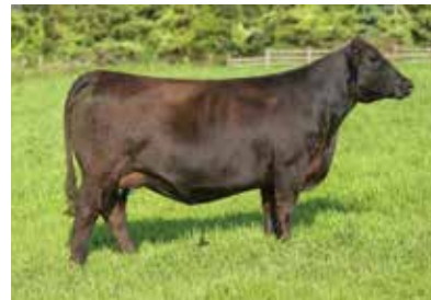
OMF/DK CHEERS C88 Dam of Lot 43