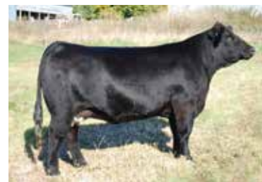
T60 | Prolific Maternal Granddam of Lot 8