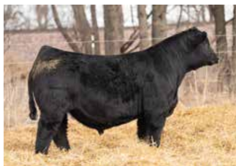
FIVE STAR JUICE J8 Full Brother to Lot 54