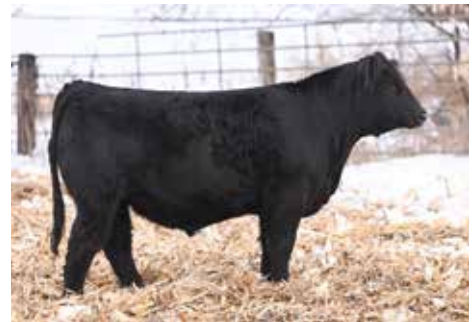
FIVE STAR KIRIL K29 Maternal Brother to Lot 35