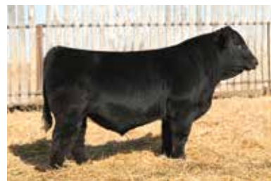
OMF JURASSIC J58 | Maternal Brother to Lot 57