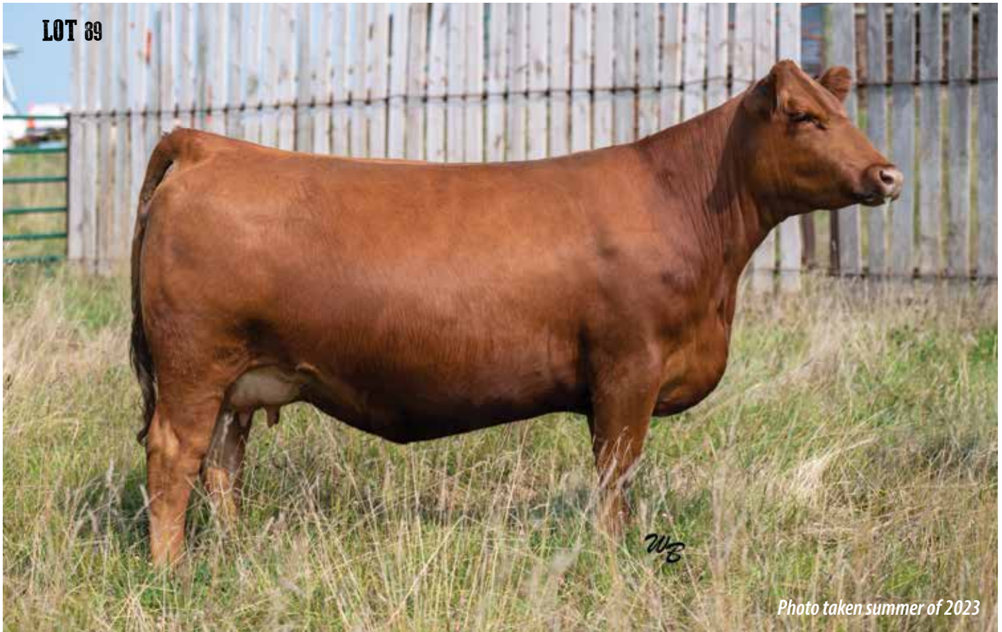
Photo taken summer of 2023