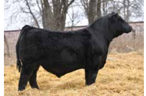
GLS/KB FINESSE Y187 Maternal Granddam of Lot 56