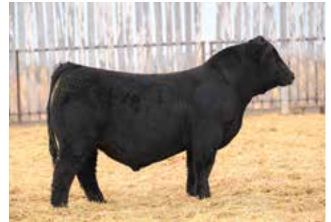
OMF LUDACRIS L17 3/4 Brother to Lot 51 - He sells as Lot 1!