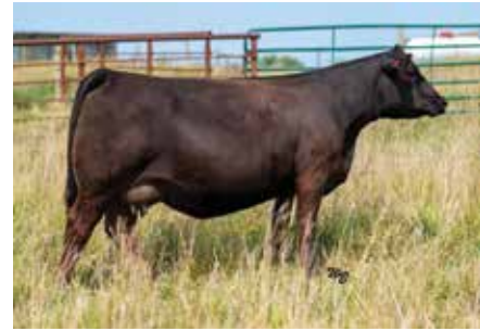
OMF/DK JOSEPHINE 3J | Dam of Lot 19

Maternal Granddam of Lot 19 & Dam of Lot 20