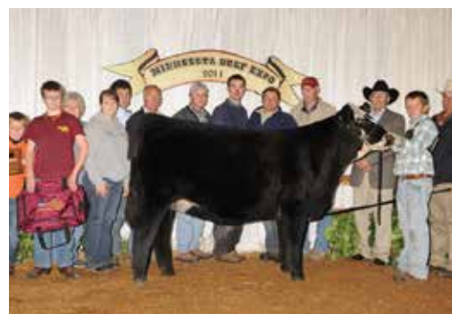
OMF ELIN X58 | Third Generation dam of Lot 69