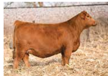
OMF/DK JOSIE 31J | $22,000 Dam of Lot 37