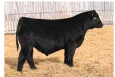
OMF KESSLER K89 | Maternal Brother to Lot 12