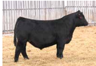
OMF/DK KANNON 19K Full Brother to Lot 43