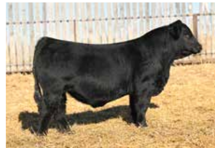
OMF/DKSM DENSITY J34 $52,000 Maternal Brother to Lot 20