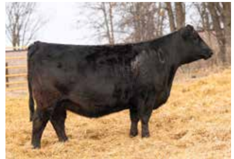
FIVE STAR HELENA H29 Dam of Lot 35