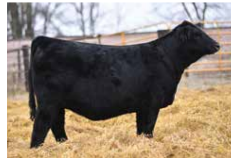
FIVE STAR HARMONY H27 | Maternal Sister to Lot 39