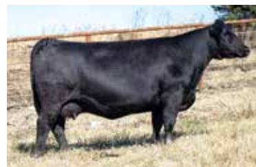
HOOKS ANGEL 11A | Dam of Lot 4