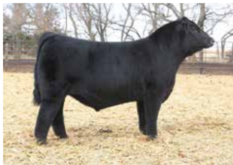
OMF HARD RIGHT H21 $60,000 Maternal Brother to Lot 33