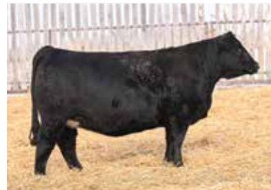
OMF/DKSM JERRILYN J44 Maternal Sister to Lot 43