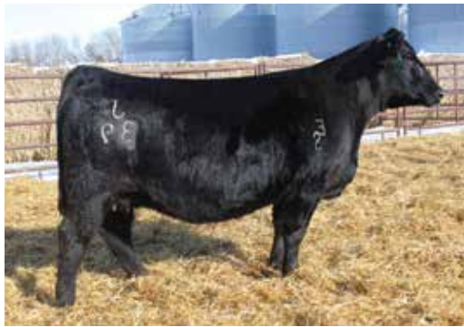
ES J39 | Dam of Lot 44