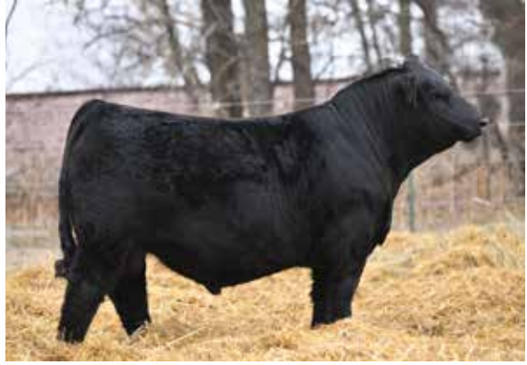
FIVE STAR HUMBLE H21 | Maternal Brother to Lot 83