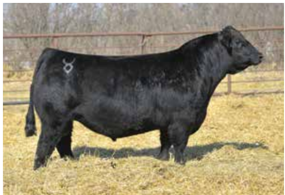
EGL FIRESTEEL 103F | Service Sire to Lot 82