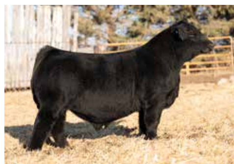
OMF JACK J45 | Sire of Lots 29 & 30