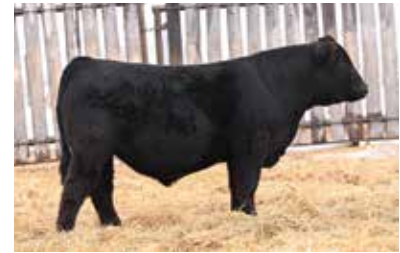
OMF KONRAD K29 3/4 Brother to Lot 25