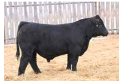
OMF KILO K47 | Full Brother to Lot 18