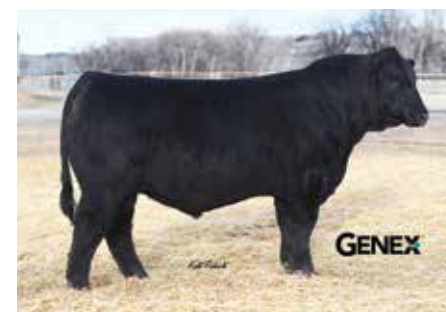
LBRS GENESIS G69 Sire of Lot 87