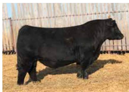
BRIDLE BIT KOJAK K297 Service sire to countless females throughout the offering!