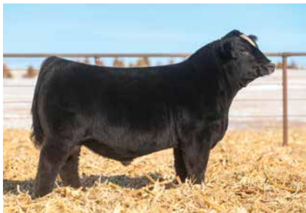
KCC1 COUNTERTIME 872H | $230,000 Sire of Lots 1-9