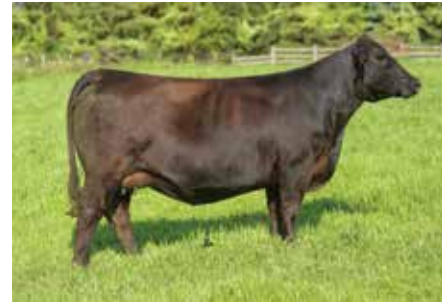
OMF/DK CHEERS C88

Maternal Granddam of Lot 19 & Dam of Lot 20