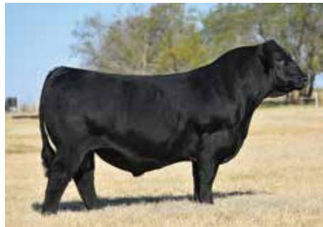
ES RIGHT TIME FA110-4 Sire of Lot 51