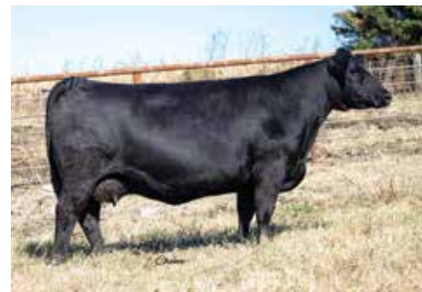
HOOKS ANGEL 11A | Dam of Lot 33