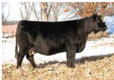
FIVE STAR SHEILA C1 Dam of Lot 5