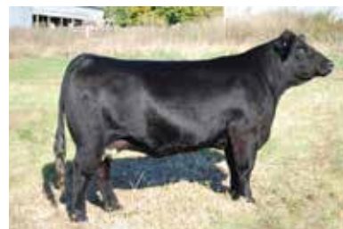
T60 | Maternal Granddam of Lot 58