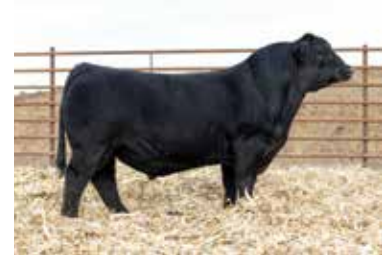
OMF EPIC E27 | Sire of Lots 17-19