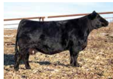
OMF BLACK BETTY Y12 | Maternal Granddam of Lot 6