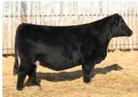
OMF HONESTY H48

Dam of Lot 52 & Maternal Granddam of Lot 53