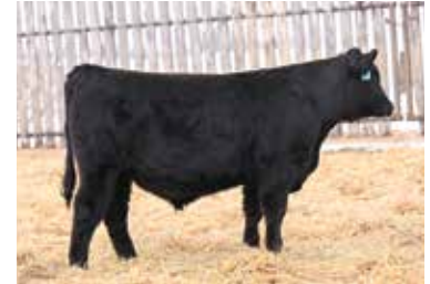
OMF KILLIAN K87 | Maternal Brother to Lot 11