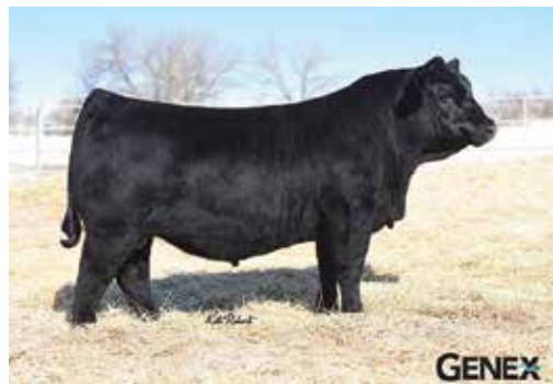
HOOK'S EAGLE 6E | Sire of Lot 85