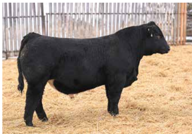
OMF KONG K41 | Product of the "Y37" Cow Family