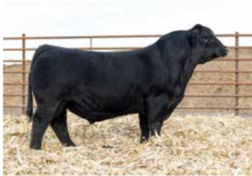
OMF EPIC E27 | Sire of Lots 64-68