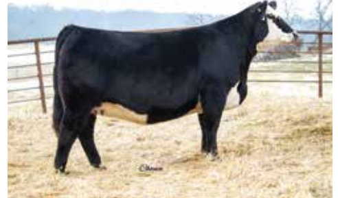
OMF ELVIRA E24 | Maternal Granddam of Lot 23