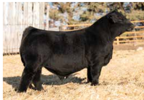
OMF JACK J45 | Full Brother to Sire of Lot 69