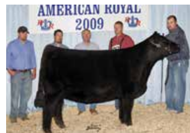
GLS/GF MISS FRONTIER U30 Maternal Granddam of Lot 9