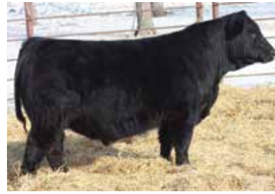
W/C REST EASY 752G Sire of Lot 42