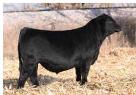
FIVE STAR KING K14 Full Brother to Lot 55