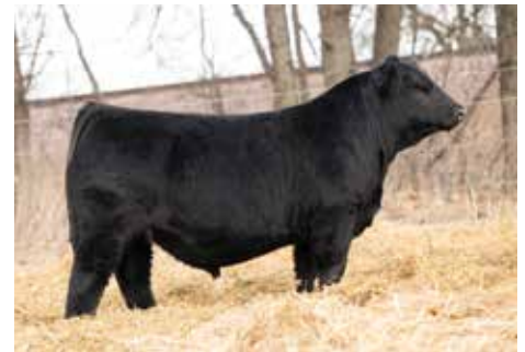
KBHR F316 Dam of Lot 61