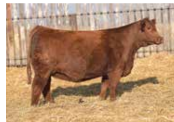
OMF/DK GINGER G50