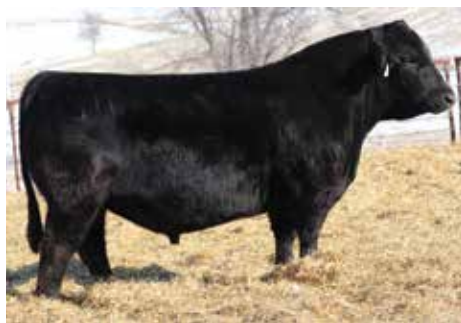
RUBYS TURNPIKE 771E | $71,000 Sire of Lot 33