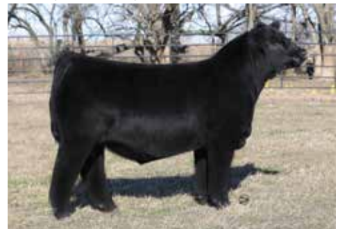
STCC TECUMSEH 058J | $620,000 Sire of Lots 31 & 32