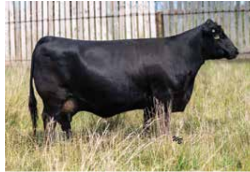
DKSM BROOKE B01 | Dam of Lot 66