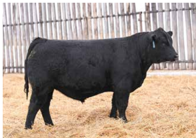
OMF KEE K34 | Maternal Brother to Lot 14