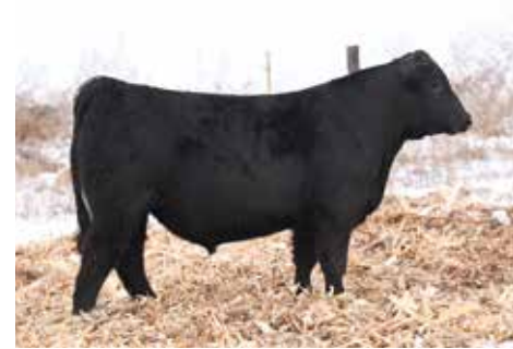
FIVE STAR KOSHER K13 | Maternal Brother to Lot 39