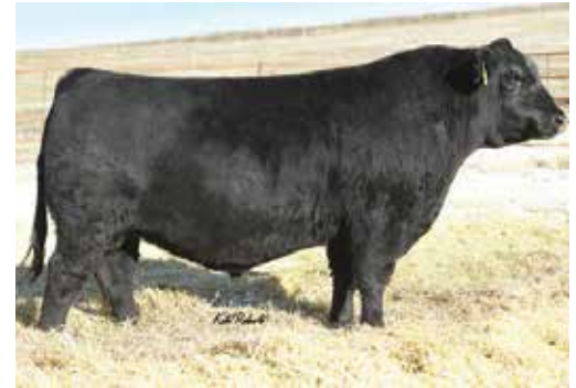
TJ GOLD 274G Sire of Lots 80 & 81