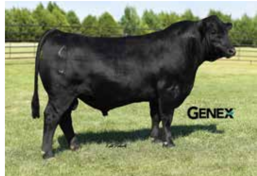
TJ NEBRASKA 258G | Sire of Lot 45