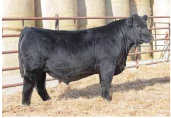
HOOK'S FULL FIGURES 11F | Sire of Lots 83 & 84