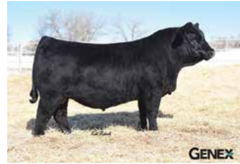
HOOK'S EAGLE 6E | Sire of Lots 38 & 39