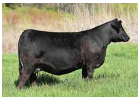
FIVE STAR GLORY G19 Dam of Lots 54 & 55