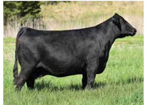
GLS/KB FINESSE Y187 Prolific Maternal Granddam of Lot 15